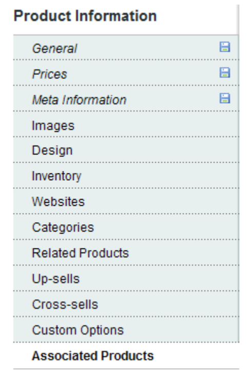
Figure 2: Tabs for New Configurable Product

This tab opens a form that allows the store owner to set three different things.